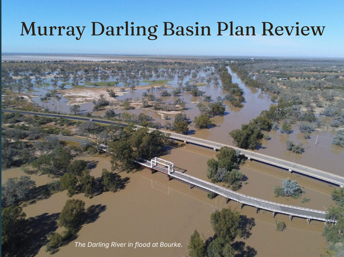
The Darling River in flood at Bourke.